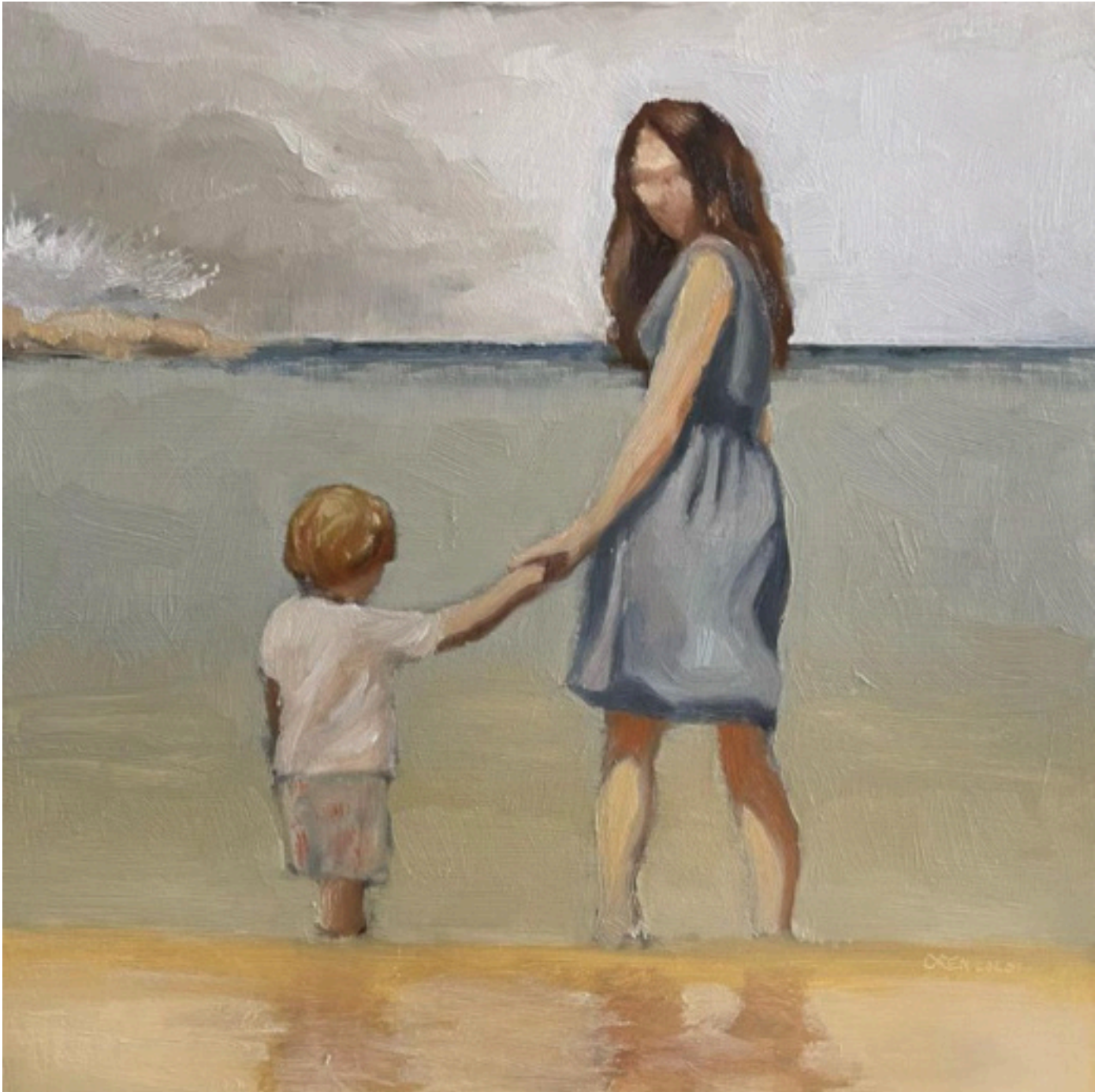
Still in the Distance (Sold)