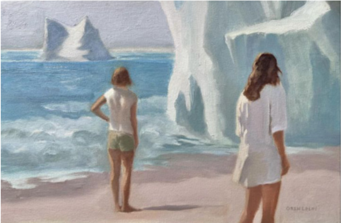
The Beached Tower