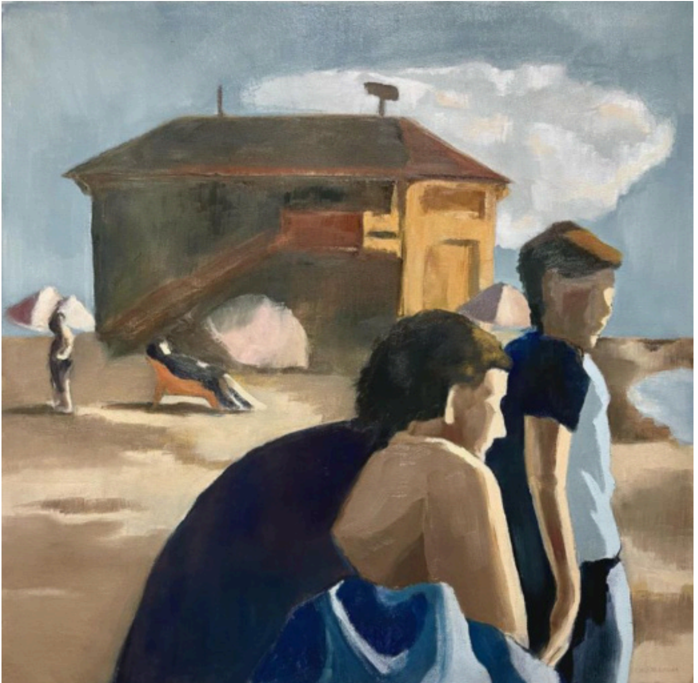
Incomprehensible Vastness (Sold)