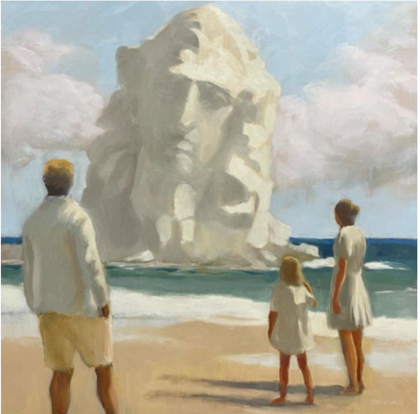
An Empty Beach

Oil on Canvas, 21x21 inches (Longlisted Entry Jackson's Art Prize)