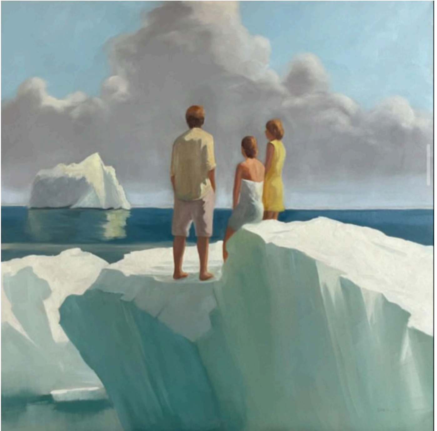
A Distant Horizon