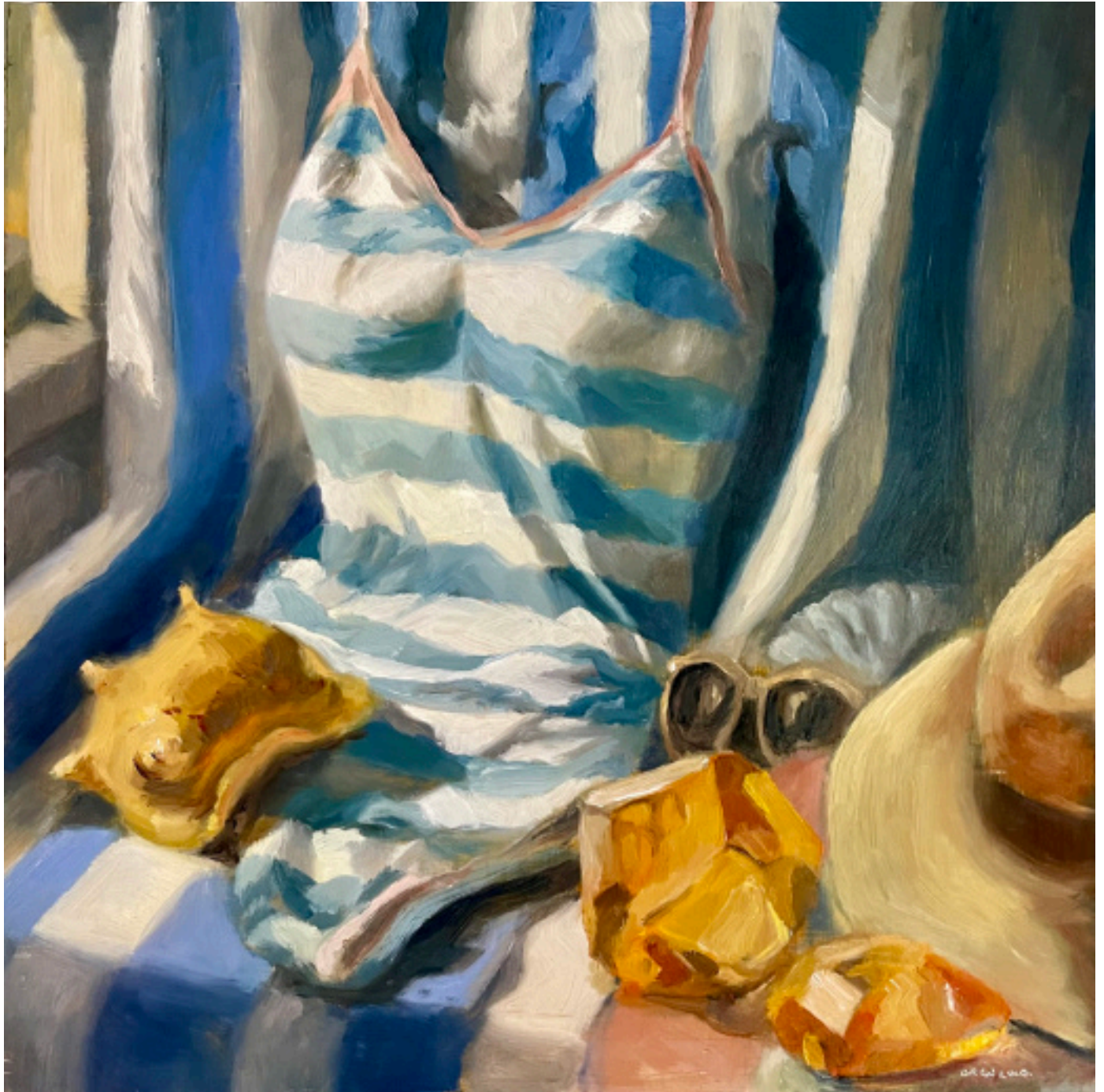
Hang It Up