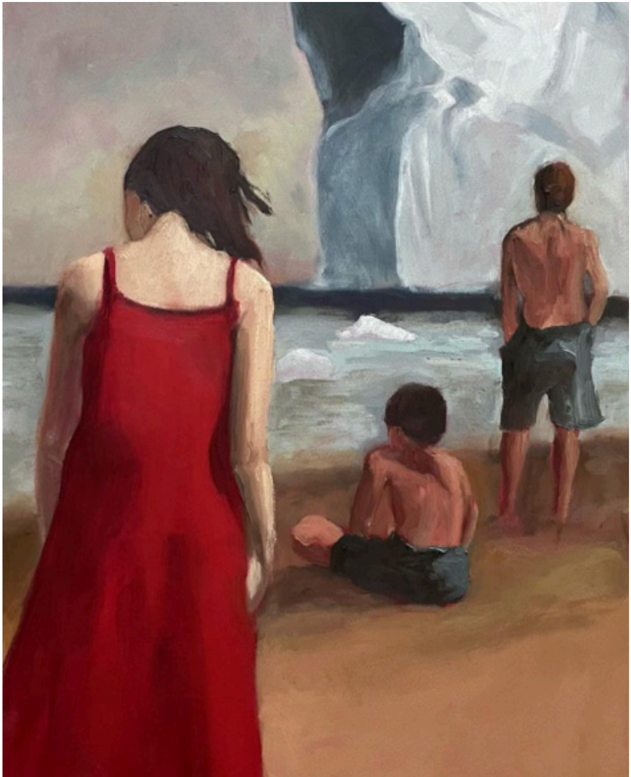
The Last Summer Day