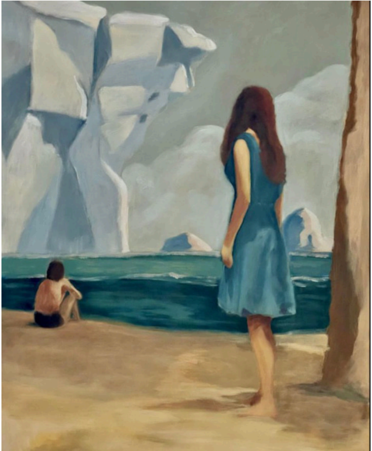
A New Summer