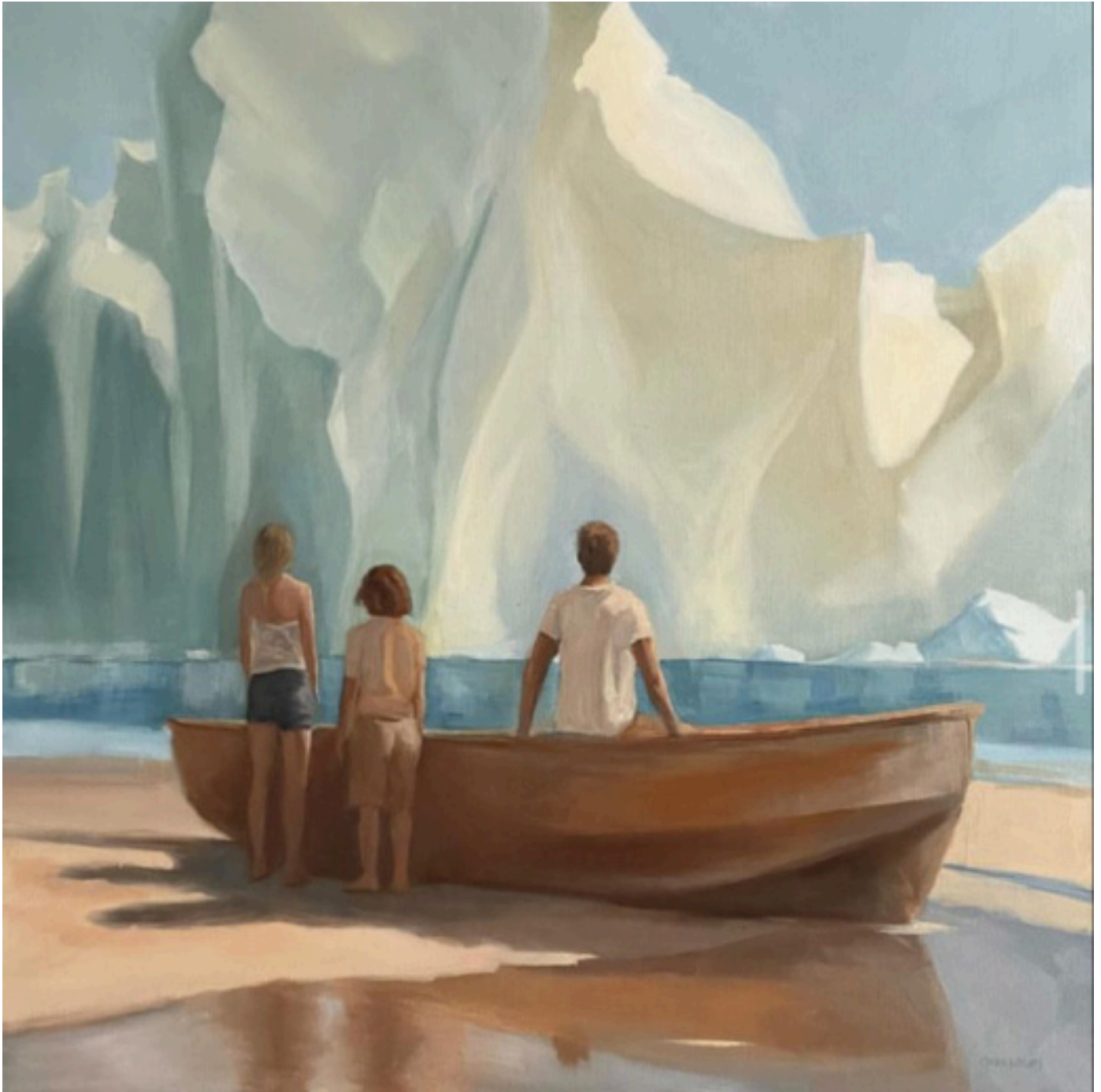
Behind the Wall