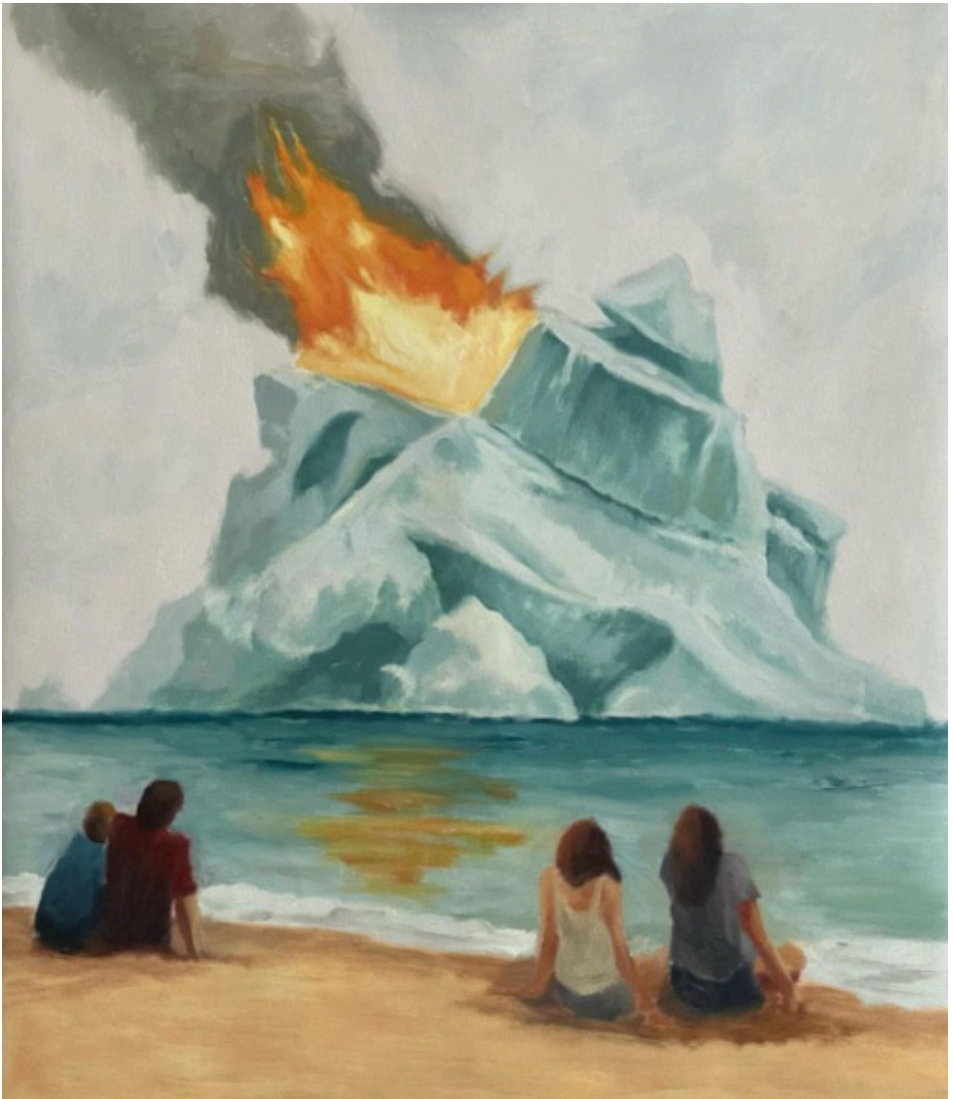
The Watch Party